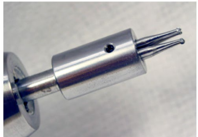
Adding creativity and realism to your service!